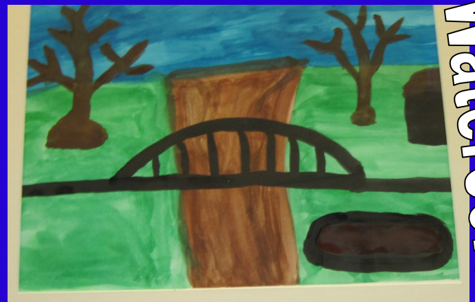
The Club is an color drawing created by Carby Bailly