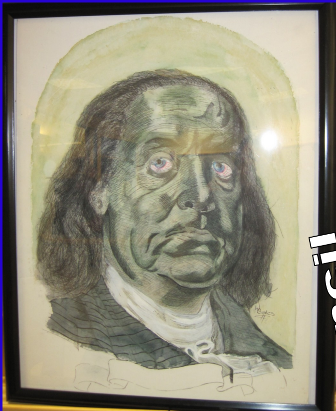
The Watchers is a n acrylic created by Wardsey Gates