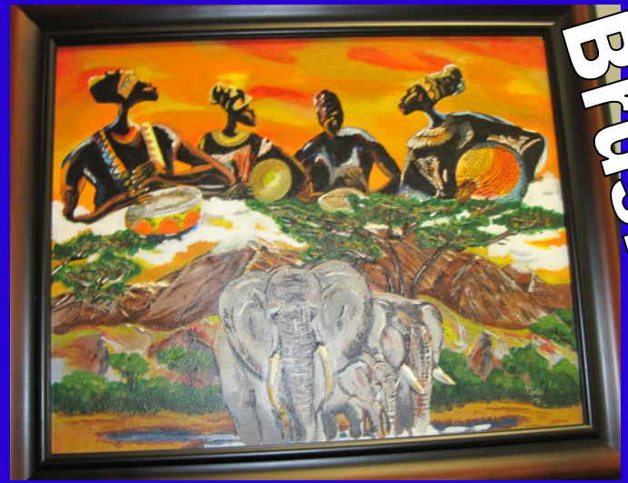
All About Benjamin' is a drawing created by Wardsey Gates